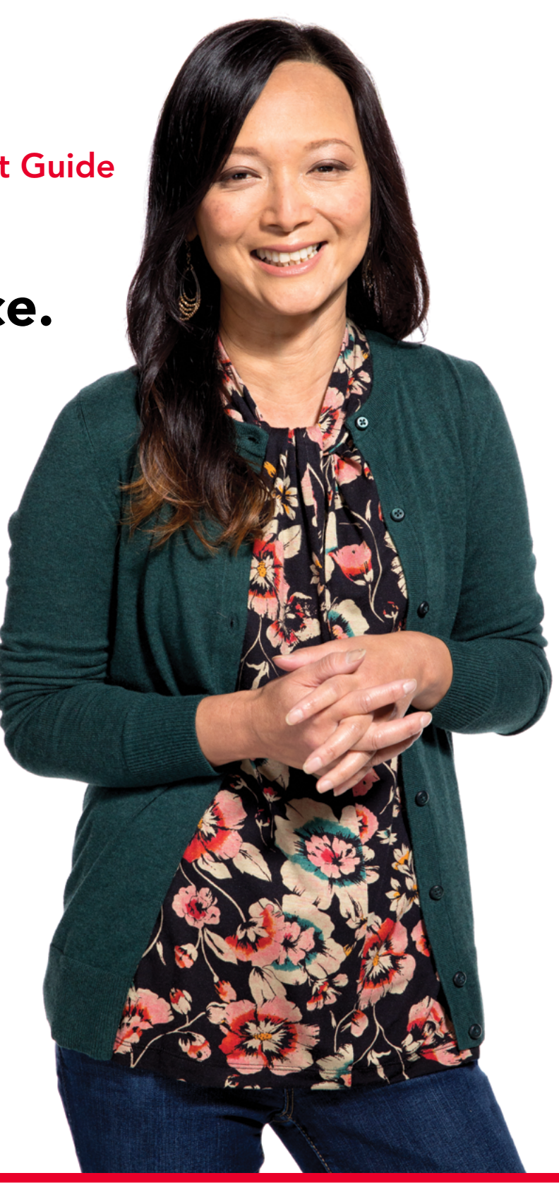
Harvard Pilgrim Health Care includes Harvard Pilgrim Health Care, Harvard Pilgrim Health Care of New England and HPHC Insurance Company.

For employers with up to 50 full-time equivalent employees